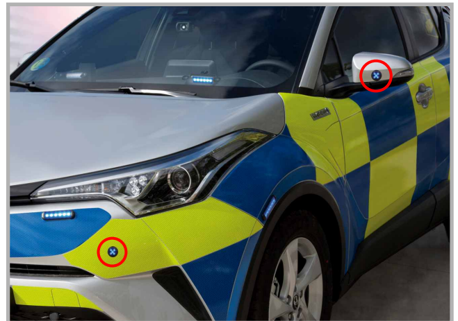
NanoLED Round installed with the NanoLED lights